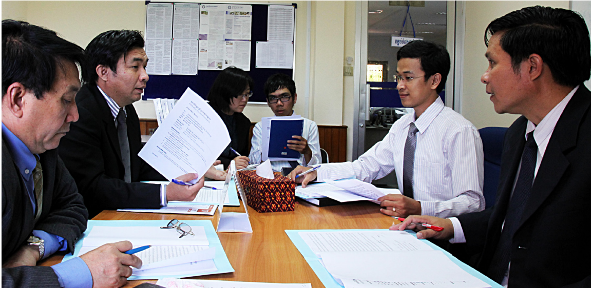
Arbitrators and ACF legal staff meeting prior to the hearing.

The Arbitration Council's mission is to resolve collective labour disputes in Cambodia. Through effective and credible labour dispute resolution, the Council seeks to contribute to the stabilisation and promotion of wages and productivity of workers and employers respectively as well as to the growth of Cambodian economy more broadly. The monthly AC E-Newsletters is a special edition of the Arbitration Council Foundation that captures the binding arbitration cases covered by the Memorandum of Understanding on Promoting Industrial Relations in the Garment Industry 2010 (MoU). It intends to share with the employers, unions, workers, and general public the information regarding binding arbitration cases covered by the MoU that the Arbitration Council processes.